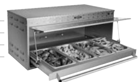
Model GRMW-4 with 4 accessory third-size pans

ALL GLO-RAY METAL SHEATHED HEATING ELEMENTS WARRANTED AGAINST BURNOUT AND BREAKAGE FOR TWO YEARS. ALL GLO-RAY BLANKET HEATING ELEMENTS WARRANTED AGAINST BURNOUT FOR ONE YEAR.