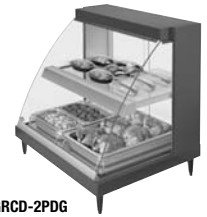
Model GRCD-2PDG with pan rail and optional Designer color

Cord Location: .....Control side at right base corner. ALL GLO-RAY METAL SHEATHED HEATING ELEMENTS WARRANTED AGAINST BURNOUT AND BREAKAGE FOR TWO YEARS. ALL GLO-RAY HEATED GLASS SHELVES AND BASE BLANKET HEATING ELEMENTS WARRANTED AGAINST BURNOUT FOR ONE YEAR.