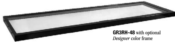
GR3RH-48 with optional Designer color frame

Voltage: .....120, single phase only. Models Shipped with: .....Remote toggle, circuit breaker, and GFCI. Dimensions: .....610, 914, or 1219 W x 381 D (with sneeze guards ) x 35 H mm (24", 36", or 48" x 15" x 1 3/8") Useable Heated Top Shelf Space: .....Width of unit minus 70 x 318 D mm (2 3/4" x 12 1/2") Included with Foodwarmer: .....Remote toggle, circuit breaker, and GFCI. Leads: .....152 mm (6") Pigtails, multiple knockout locations. ALL GLO-RAY HEATED GLASS SHELVES WARRANTED AGAINST BURNOUT FOR ONE YEAR.