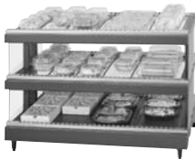
Model GR3SDS-39D with optional Designer color