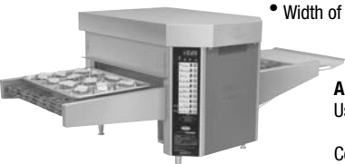
Conveyor Model TFC-461R with backstop tray/landing platform and accessory pan

ALUMPAN.....Half-Size Sheet Pan – 457 W x 330 D mm (18" x 13").....$ 20.