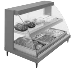
Model GRCDH-3PDG with pan skirt and optional Designer color

Water Chamber Capacity: .....3 liters (3 quarts). Cord Location: .....Control side at right base corner. ALL GLO-RAY METAL SHEATHED HEATING ELEMENTS WARRANTED AGAINST BURNOUT AND BREAKAGE FOR TWO YEARS. ALL GLO-RAY HEATED GLASS SHELVES AND BASE BLANKET HEATING ELEMENTS WARRANTED AGAINST BURNOUT FOR ONE YEAR.