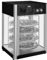
Model FDWDE-1 with rotating 4-tier circle rack