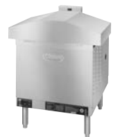
Model PMG-60 with optional stainless steel body and base and Model PMGH-60 Hood