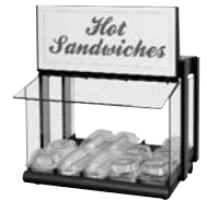
Model GRHW-1SGS with sneeze guard, accessory sign holder (graphic not included), five hardcoated bins, and optional Designer color

Voltage: .....120, single phase only, NEMA 5-15P plug. Base Dimensions – GRHW-1SGS: .....565 W x 371 D (22 1 / 4 " x 14 5 / 8 "). – GRHW-1SGD, -1SGDS: .....581 W x 378 D (22 7 / 8 " x 14 7 / 8 "). Included with Merchandiser: .....Thermostatically-controlled base, sneeze guard, display lights, 35 mm (1 3 / 8 ") rubber legs, five 102 mm (4") bins (GRHW-1SGS only), 1829 mm (72") cord and plug. Cord Location – GRHW-1SGS: .....Base end plate, same side as switch. – GRHW-1SGD, -1SGDS:.....Control side, bottom right. ALL GLO-RAY METAL SHEATHED HEATING ELEMENTS WARRANTED AGAINST BURNOUT AND BREAKAGE FOR TWO YEARS. ALL GLO-RAY HEATED GLASS SHELVES AND BASE BLANKET HEATING ELEMENTS WARRANTED AGAINST BURNOUT FOR ONE YEAR.