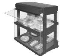
Model GRHW-1SGDS with Designer color, sneeze guard, and slanted hardcoated base