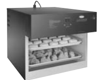
Model FSHAC-2 with accessory pans