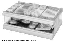
Model GR3SDH-39 with optional stainless steel