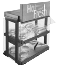
Model GRHW-1SGD with Designer color, sneeze guard, and accessory sign holder (graphic not included)