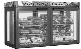
Model LFST-48 with 3-shelf multi-purpose rack, sign holder, and optional Designer color