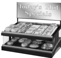
Model GR3SDS-39 with optional Designer color and accessory top sign holder (sign not included)