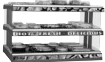
Model GR3SDH-39D with optional Designer color and accessory shelf sign holders (signs not included)