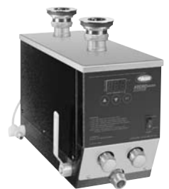
Model FR2-3 with optional auto-fill solenoid

FR-3-CAP .....1219 mm (48") Cord with Plug (NEMA 6-20P) and Receptacle (NEMA 6-20R) (FR2-3 only) .....$48. FR-4-CAP .....1219 mm (48") Cord with Plug (NEMA 6-30P) and Receptacle (NEMA 6-30R) (FR2-4 only) .....94. FR2-FLUSH .....Flush Hose, Cleaning Brush, Stopper, and Adapter .....48.